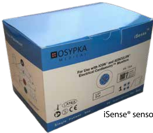
iSense® sensor box

iSense® sensors are intended for use with the Electrical Cardiometry™ (EC™) monitor AESCULON® and cardiometers ICON® and ICONCore®. iSense® Sensors are 100% disposable and are available in various sizes, for neonate, pediatric, and adults. All sensors utilize a highly conductive AgCl wet gel and strong hypoallergenic adhesion, which provides instant electrical contact for high quality signal conductivity. Four iSense® sensors are packed together in one pouch for the convenience of the user and more importantly keeping the gel fresh for best conductivity and signal quality, especially under difficult patient conditions.