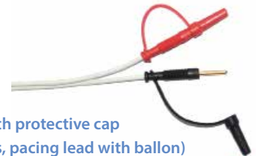
exposed pins with protective cap (Quadripolar pacing leads, pacing lead with balloon)